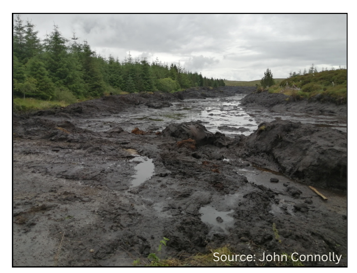
Bog slide in Shass Mountain, Co Leitrim, which occurred in June 2020.