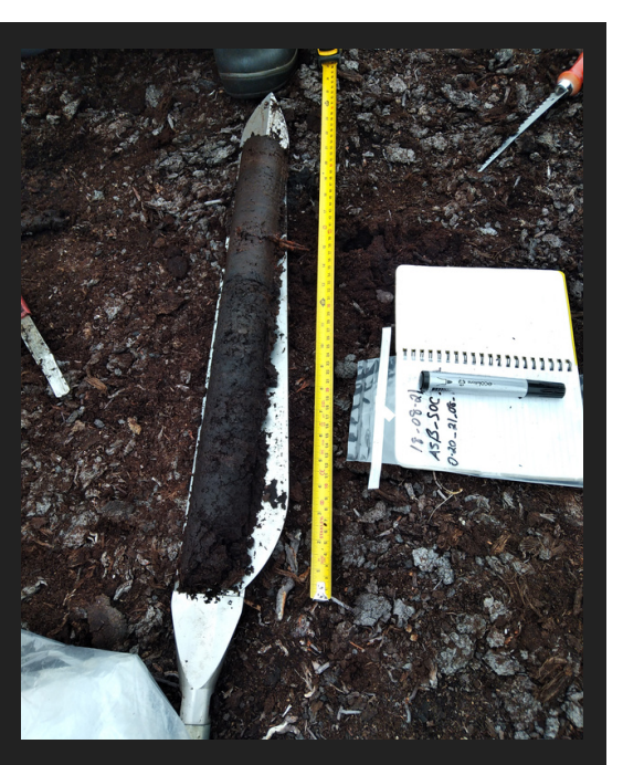
Identifying remains of vegetation (macrofossils) from a peat core (above) and under the microscope (right).

Peat soils in Ireland have been drained for 100s of years with serious implications for water, carbon loss and biodiversity.