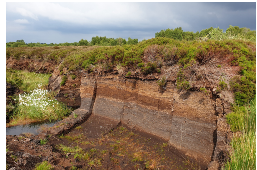
Different peat layers on cutover bog