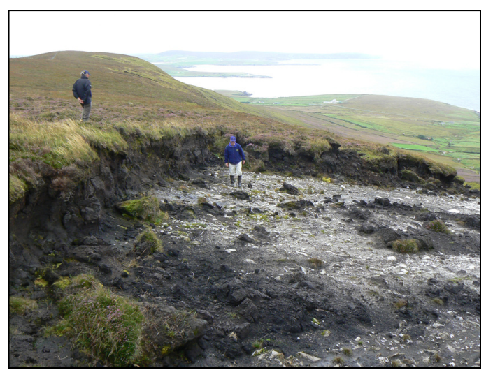
Bog slide in Pollatomish, Co. Mayo, which occurred in Sept 2003.

It is critical to accurately use the terminology associated with peat soil movement to target specific management practices and types of peatlands. A key publication provided definitions to help understand these phenomena and compare studies (258). This is important since it was found, for example, that the recovery of bog burst scars may be more rapid than for peat slide scars (565).